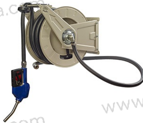
FUEL HOSE REEL DUAL ARM OHRI05

www.chiribogayjara.com ( http://chiribogayjara.com )